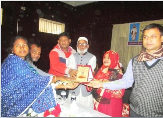
Ms. is receiving 'Joyeeta' award